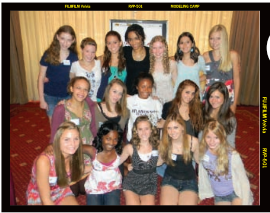
Modeling Camp campers meet with Ashley Howard from America's Next Top Model!

VISIT WITH AMERICA'S NEXT TOP MODEL ALUMNI