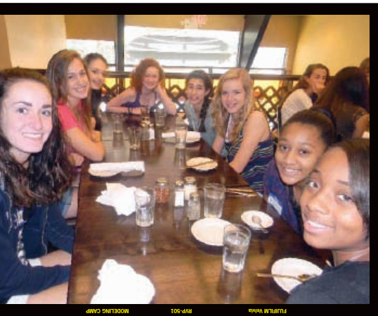
Modeling Camp at lunch.

All girls should eat a healthy, well-balanced diet and maintain a regular exercise routine. Campers learn about health and nutrition and have their own personal yoga session with a Modeling Camp Health and Fitness Instructor.