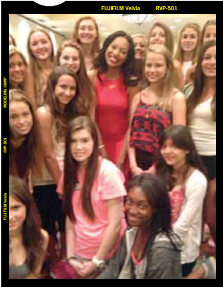
Modeling Camp campers with Bianca Golden from 'America's Next Top Model'!

VISIT WITH 'AMERICA'S NEXT TOP MODEL' ALUMNI